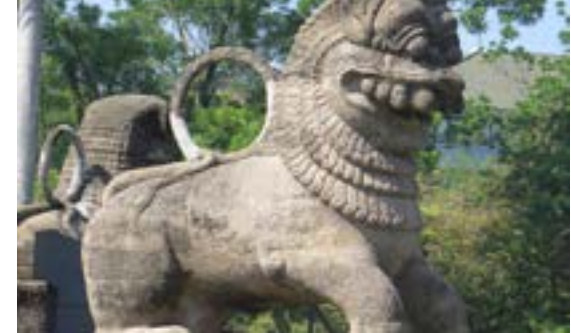
Sat 18 Jun: Colombo arrival Transfers will be provided to your hotel.

Sun 19 Jun: Hospitality tickets to 3rd ODI R Premadasa International Cricket Stadium.